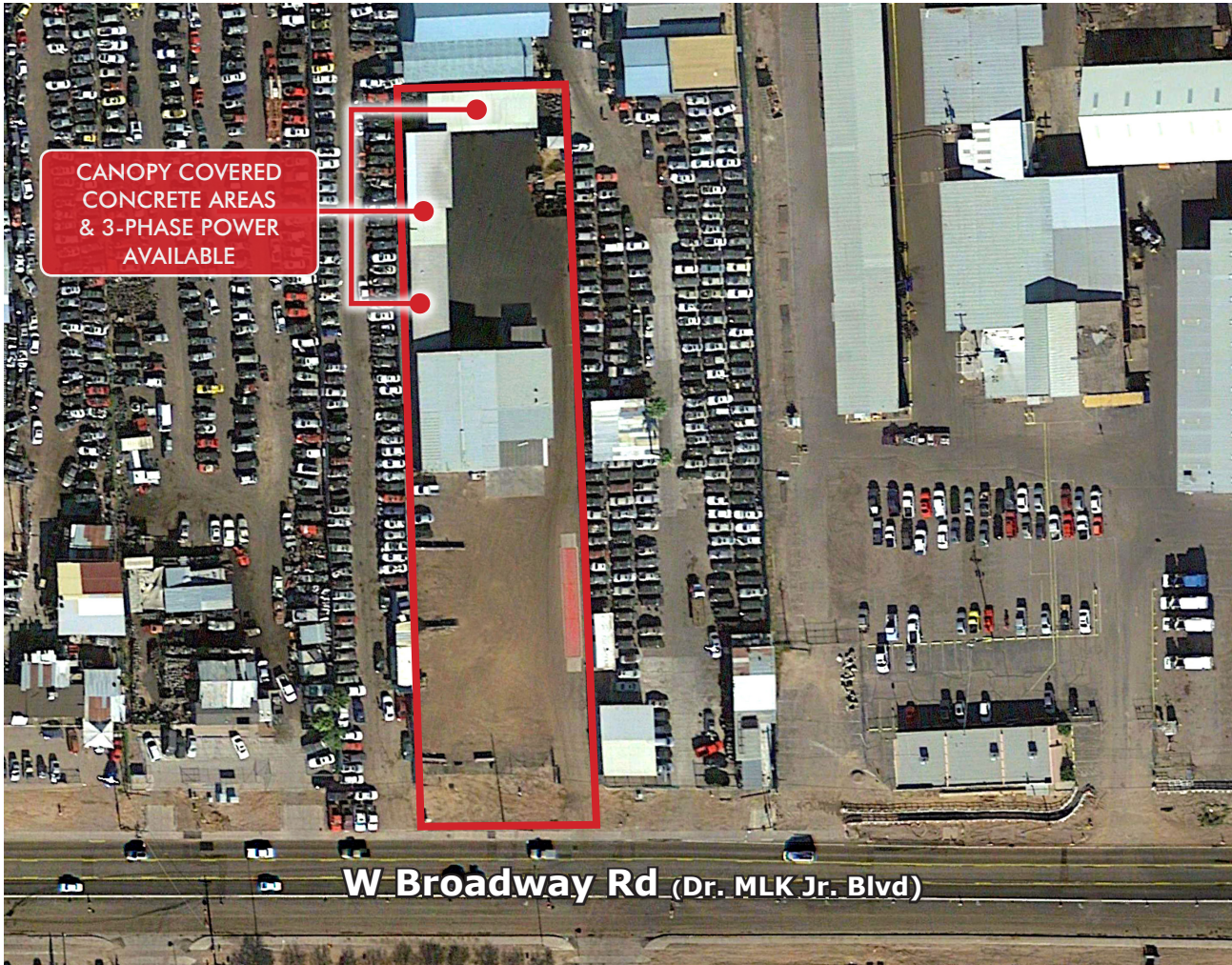
W Broadway Rd (Dr. MLK Jr. Blvd)

Live & Work / Living Room, 2 Bedrooms, Restroom & Kitchen