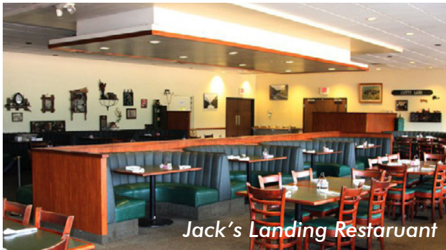
Jack's Landing Restaurant