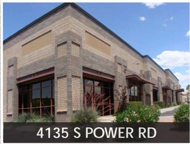
4135 S POWER RD