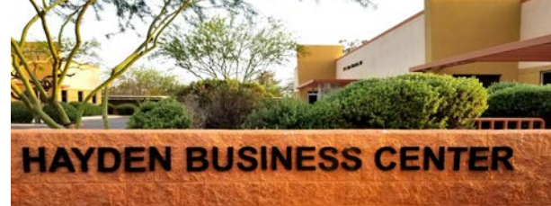
HAYDEN BUSINESS CENTER