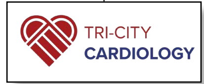
SUITE 101 | 3,200 SF Available | Fully Built-Out Turn-Key Vein Clinic Suite