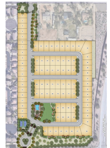
General Land Area 14.46 Acres