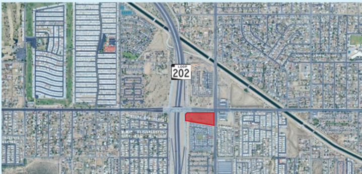
Cross-Streets SWC of Ellsworth Rd and University Dr